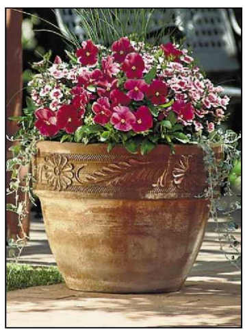
Dianthus, pansy, Silver Falls dichondra and Blue Dart juncus.

PERENNIALS PLAY WELL, TOO. Perennials like asters and goldenrod are not just for the landscape; go ahead and mix them in containers as well.